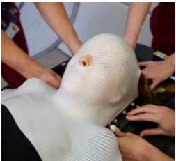
We completed the UK's first high energy Proton Therapy centre. The centre has recently treated its 1000th patient.

Under our four strategic pillars of Leading Cancer Care, The Christie Experience, delivering Local and Specialist Care and ensuring Best Outcomes, the 2018-2023 strategy set a range of ambitious objectives. A number of the successes are highlighted here: