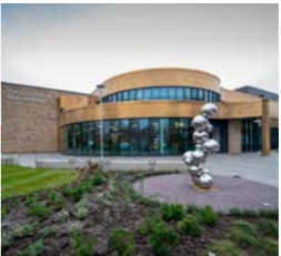
We completed The Christie at Macclesfield centre, bringing care closer to people's homes.