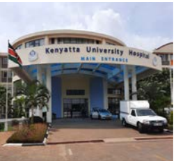
We continue to support international collaboration through our work with partners in Kenya. Supporting the successful application for a £2.8m NIHR grant to improve oesophageal cancer survival in Kenya.