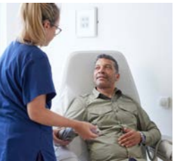
We continued to drive forward innovation in service delivery through becoming a European Centre of Excellence for Prostate Cancer.