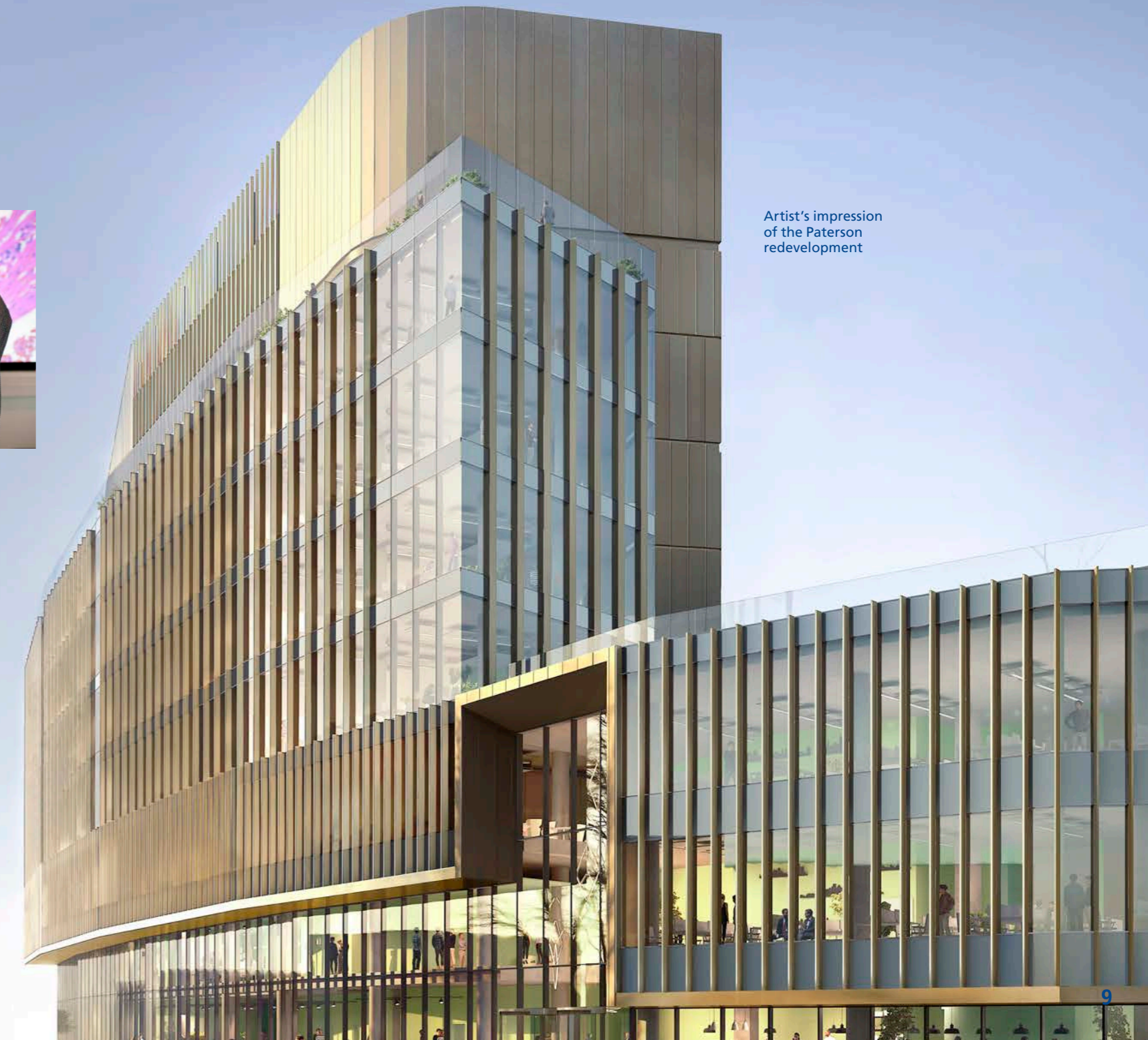
Artist's impression of the Paterson redevelopment